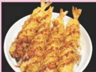
SHRIMP TEMPURA RICE BOWL

MINI $8.25 (1PC) M $11.00 (2PC) L $13.75 (3PC)