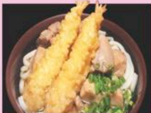
SHRIMP TEMPURA CHICKEN UDON