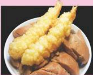
SHRIMP TEMPURA CHICKEN RICE BOWL

MINI $8.50 (1PC) M $11.50 (2PC) L $13.75 (3PC)