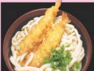
SHRIMP TEMPURA UDON